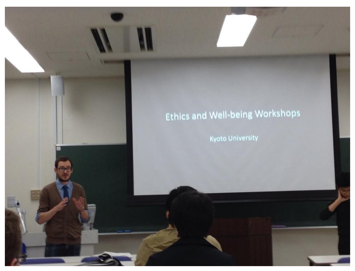
Giving a lecture at Kyoto University