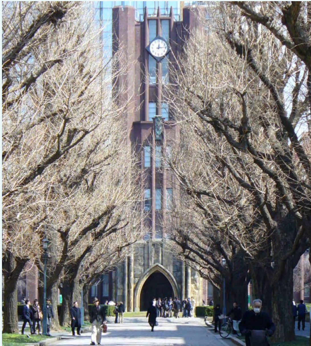
The University of Tokyo