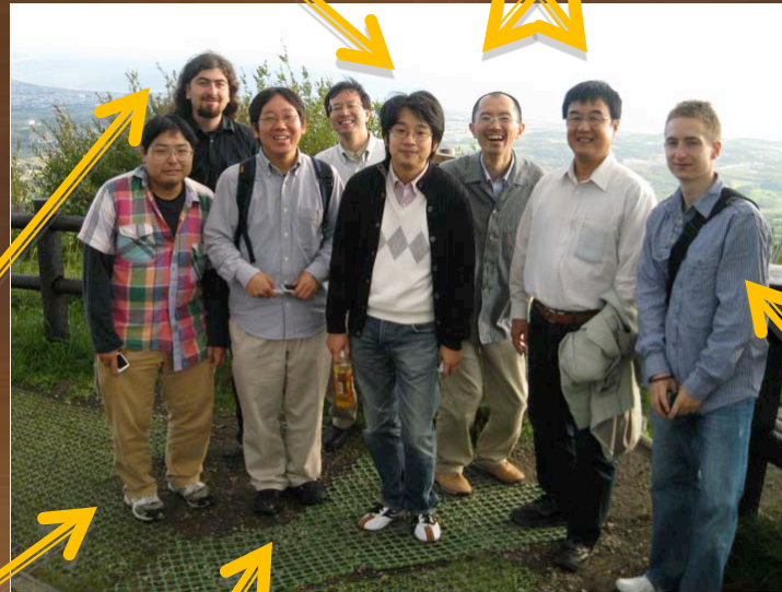
JSPS Postdoc Me!