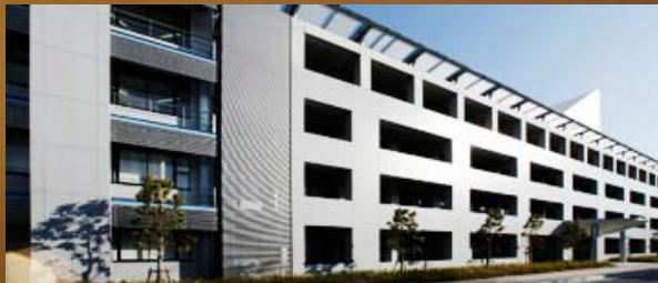
Graduate School of Engineering Science