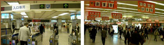
Umeda-Osaka train station, Osaka