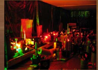
Quantum Information and Quantum Optics Group