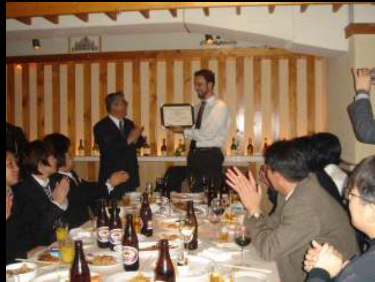
Realizing I felt at home