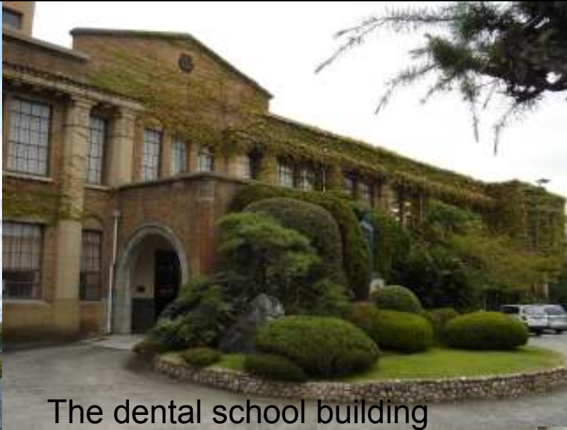
The dental school building