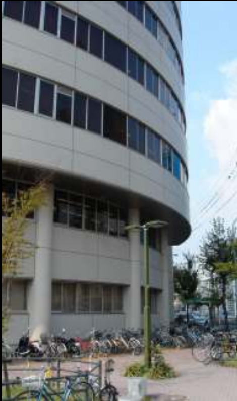
The dental hospital