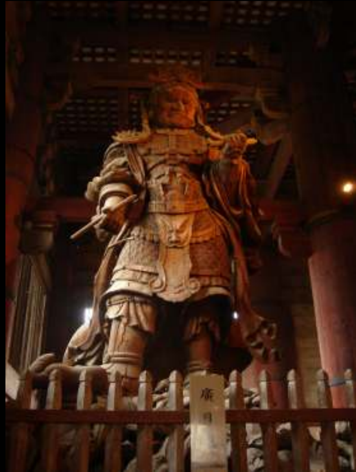
Inside the temple