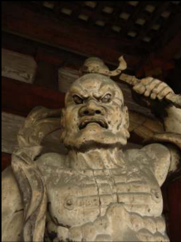
Guarding the entrance