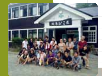
Go to Japan

On returning to the UK or RoI after completing a JSPS Fellowship, we encourage you to join our Alumni Association. Membership is free and the Association offers funding schemes exclusive to members including the BRIDGE Fellowship to revisit Japan and Symposium Scheme for Alumni members to organise an academic conference. Networking events are organized for members to stay connected and members can advertise academic accomplishments linked to Japan on the Alumni Association website. There is also a help forum for JSPS Fellows and Alumni to communicate with each other. For more information please go to: http://www.jsps.org/alumni_association/index.html