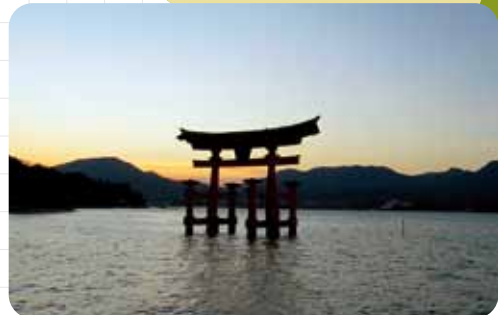
Go to Miyajima