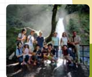
Go to Tokyo