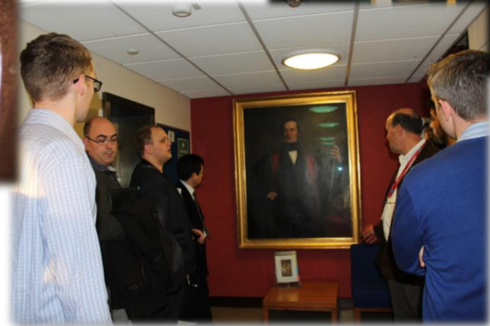
Tour of special collections at the Natural History Museum