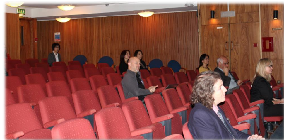
Questions and Answers