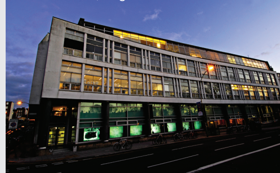
Grand Parade, Brighton

School of Applied Social Science School of Education School of Language, Literature and Communication School of Nursing and Midwifery Brighton and Sussex Medical School