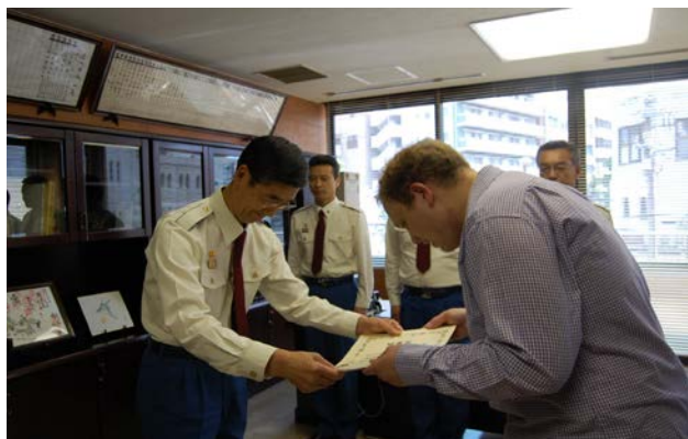
Receiving a thank you certificate from the Tokyo Fire Department for helping to free a trapped motorcyclist after a road traffic accident in Bunkyo-ku

I am just at the very beginning of my independent academic career and am very much looking forward to shaping my own area of research, both independently and through collaborations – feel free to contact me if you feel I could be of any assistance!