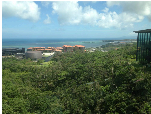
Okinawa Institute of Science and Technology (OIST)