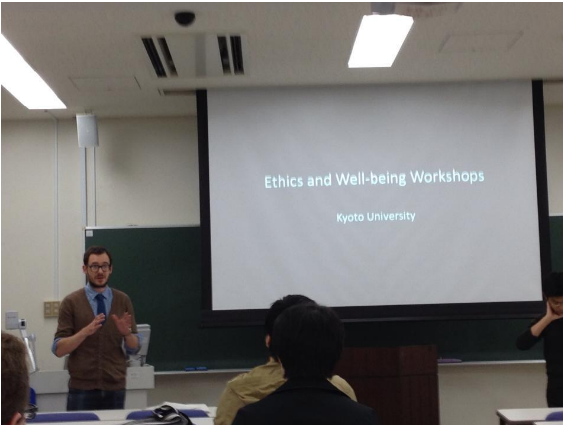
Giving a lecture at Kyoto University