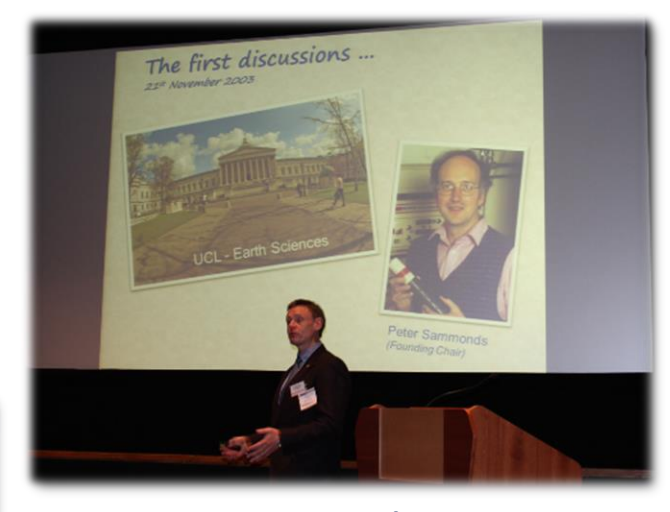
Celebration of 10<sup>th</sup> Anniversary of the UK & ROI JSPS Alumni Association