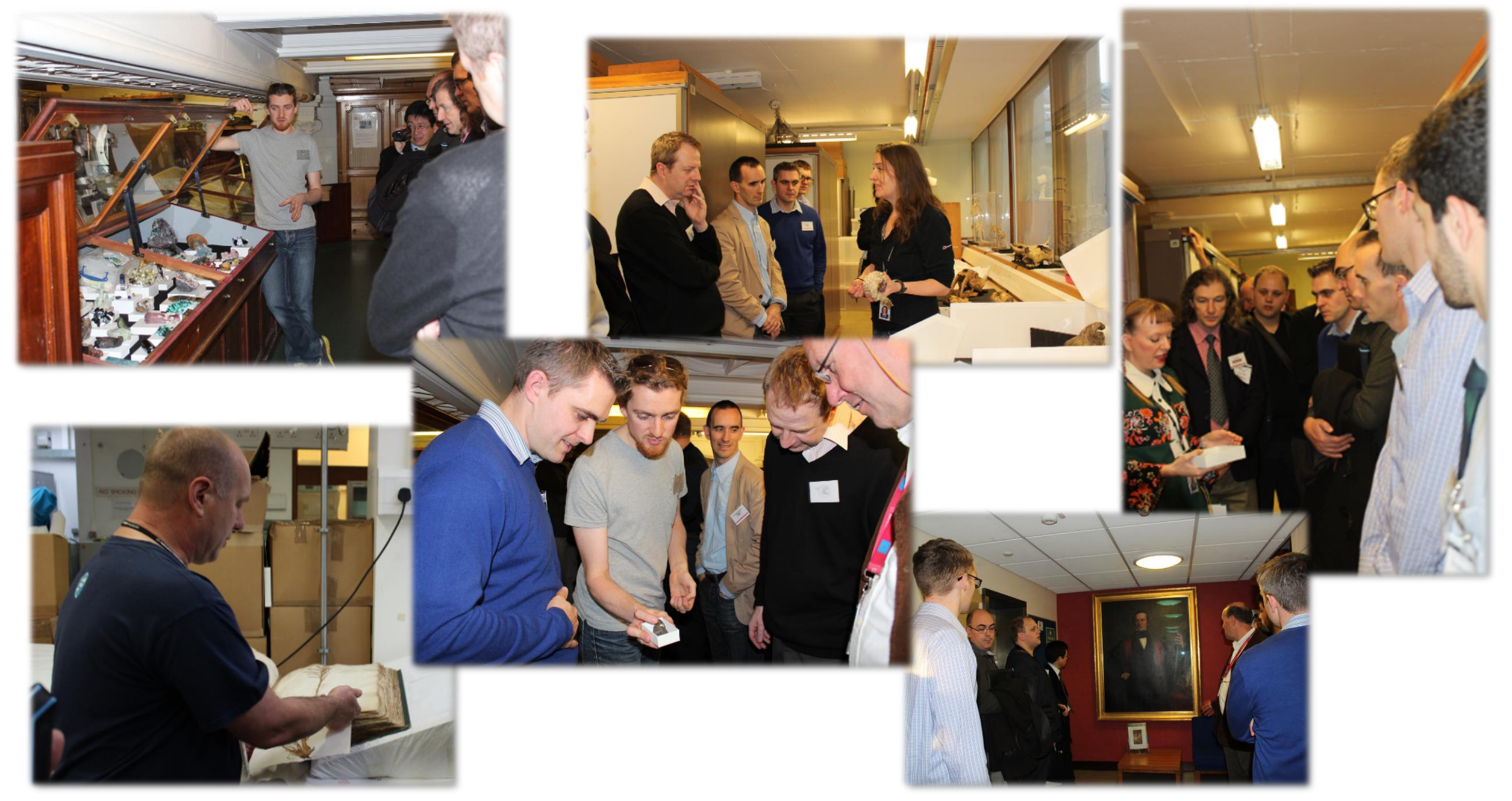
Tour of special collections at the Natural History Museum