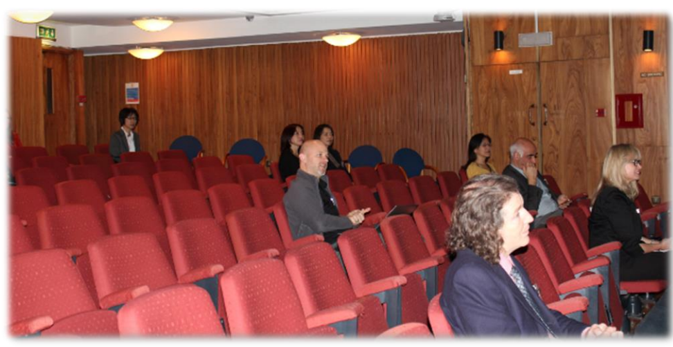
Questions and Answers