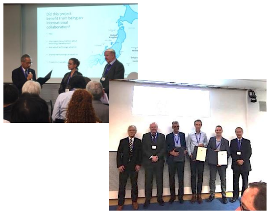
Fig. 11. Left: Group photo for the Anniversary event, Center and Right: Alumni Award Awardees.