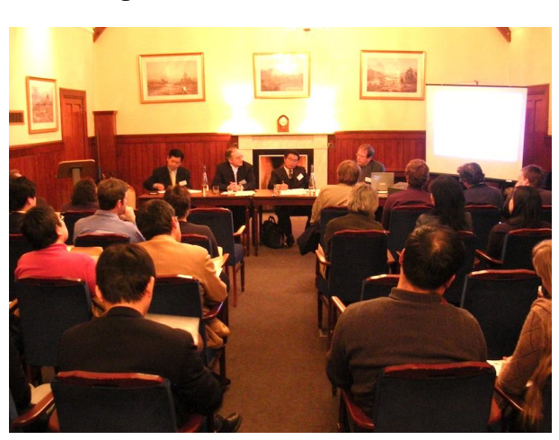
Fig. 4. Left: Participants listening intently to the lecture, Right: Panel discussion.