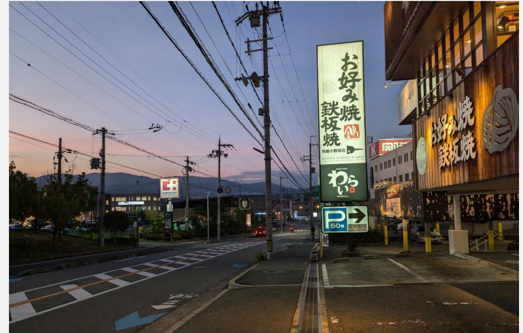
My local area (Osaka suburbs)