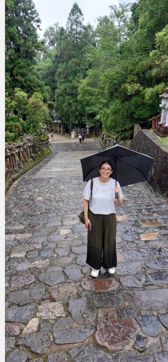
Very rainy day in Nara