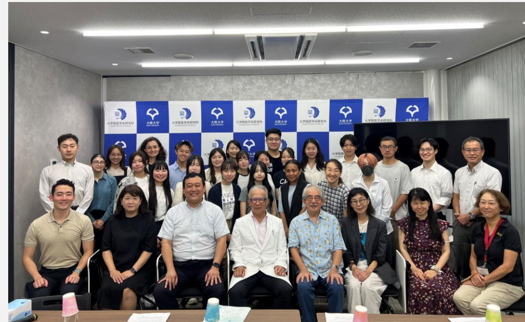
WHO Kobe event at Osaka University