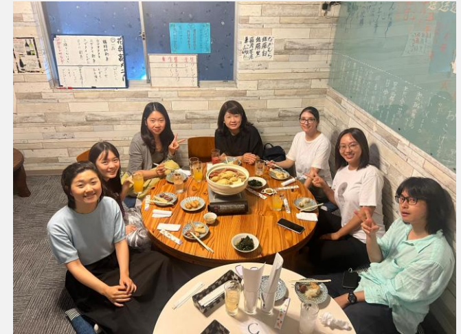
Eating oden at my leaving do