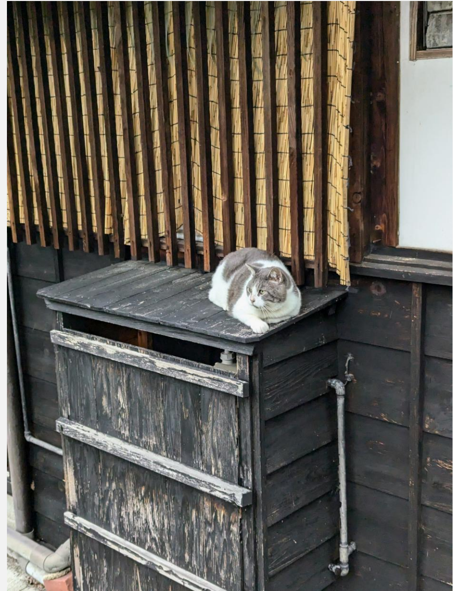
Cat on the Nakasendo trail