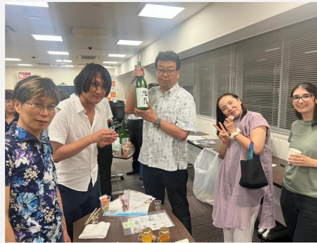
Sake tasting with host