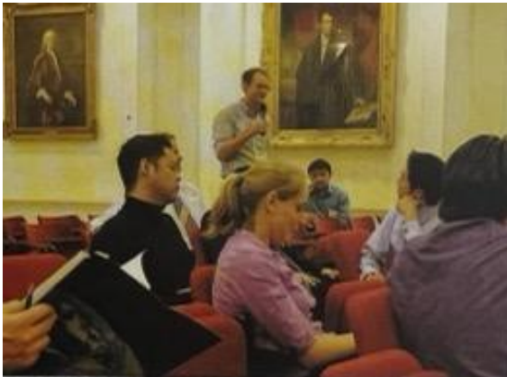
Former JSPS fellows discussing Japan experiences