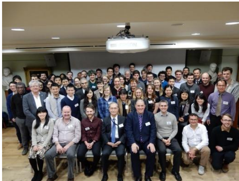
Group photo in 2018