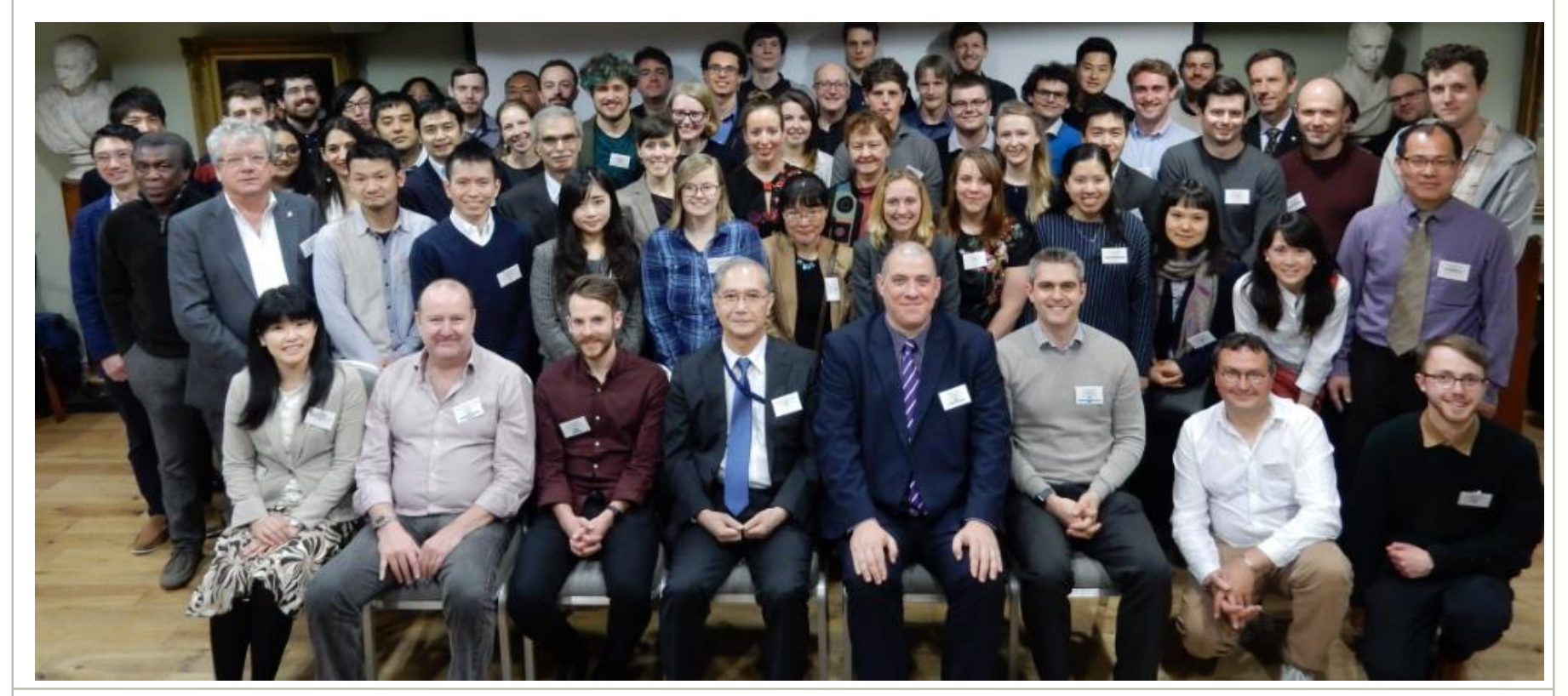
Pre departure Seminar Apr 2018

Currently 900+ active members in our Alumni Association