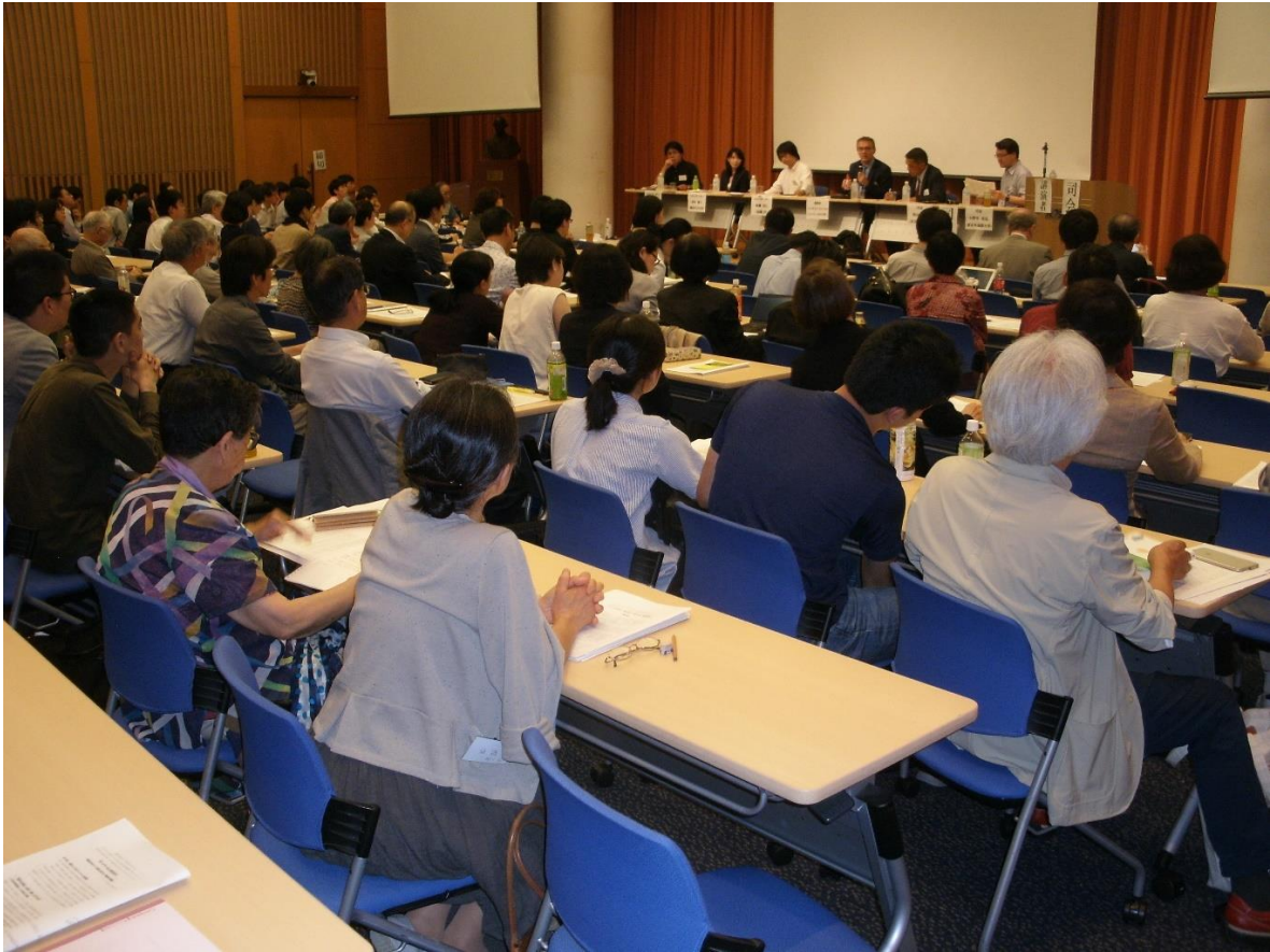
Meeting of the Japanese Society for German Studies, 30 th June 2019